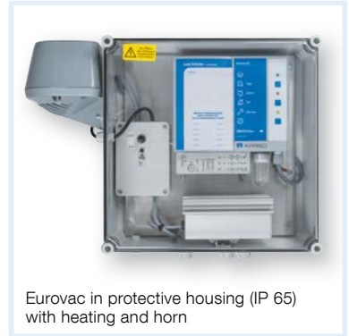
Eurovac in protective housing (IP 65) with heating and horn