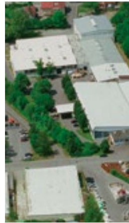
Headquarters in Güglingen