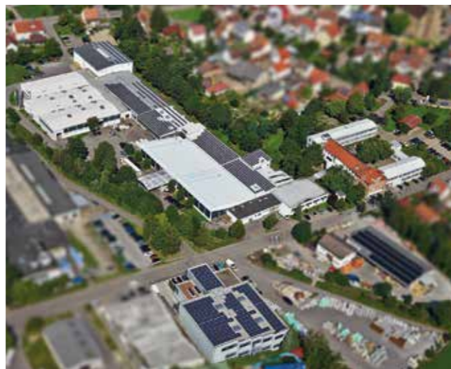
Headquarters in Güglingen (Germany)